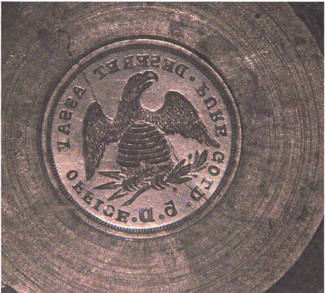
Fig. #61 Close-up of the original 1860 reverse die. Note the differences in the beehive, eagle, and position of the lettering.

A photo of the reverse die below shows the differences between the two sets of dies. From this picture you can more easily identify the differences in the design of the first and second sets of 1860 dies. It also has a crack which is very noticeable on the die, but is far less obvious on the actual coin as pictured on the preceding page.