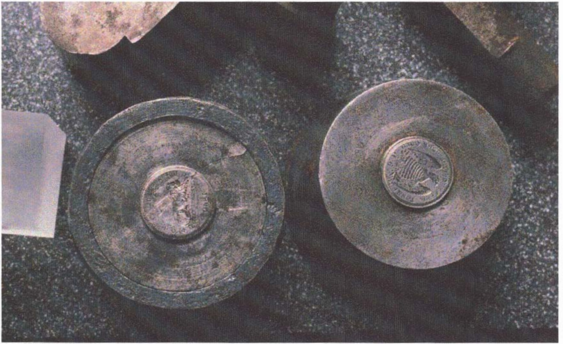
Fig. #56 Pictured above is a grouping of 1860 coinage dies. The obverse die pictured at the left is the original obverse die which was used in striking only a few copper coins before it cracked. The die to the right is the second reverse die, and was not paired with the die to the left. This reverse die was used in striking the 1860 gold coins.