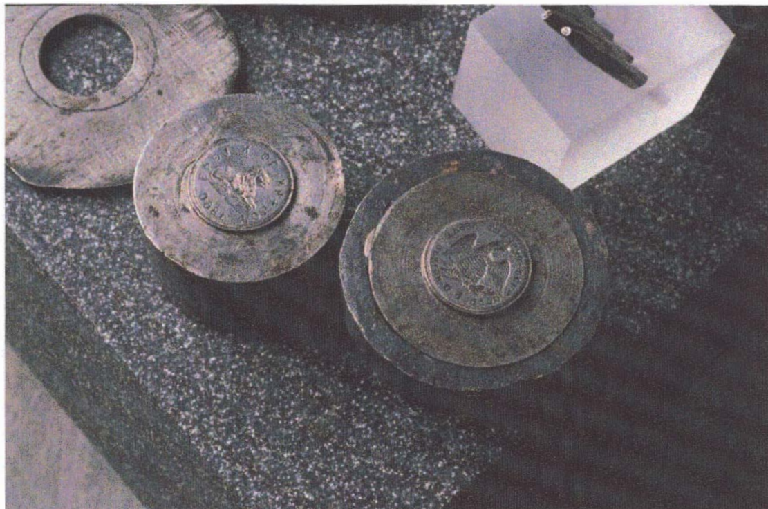
Fig. # 57 Shown above is a second grouping of 1860 coinage dies. As in the previous figure, these two dies were never mated together for actual coinage. The left-hand die is the second to be used for regular 1860 gold coinage. The right hand die was the reverse die mated with the original obverse die (with the mountains) used for striking copper test tokens.