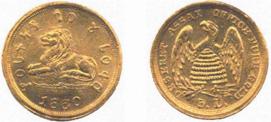
Fig. #53 Shown here is an example of the 1860 gold coin. Note that there are no mountains behind the lion. The translation of the Deseret alphabet on the obverse is "Holiness To The Lord."

The 1860 coin was minted from gold recently discovered in Colorado. 99 There were 785 pieces coined with the 1860 date. Today, only 25-35 are known. Late in 1861 the governor of the territory prohibited the issue of private circulating gold coinage. 100 The U.S. mint, which had been operating for several years in San Francisco, was supplying an adequate supply of coinage for California and the western United States. In June, 1862 the United States Congress passed a law prohibiting private coinage of gold. This ended a very colorful era in which dozens of beautiful coins had been privately minted from the first gold recovered in the foothills of Northern California.