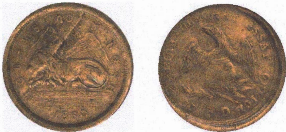
Fig. #60 1860 test coin struck from the original die pair

Pictured below is of one of the two known test pieces struck from the first pair of dies. As you can see the crack present in the die (fig. #58) has been transferred to the coin itself. The design elements are similar but you can easily notice that both the obverse and reverse dies are definitely different. The lion has a marked difference from the 1860 gold coin and the lettering, although still in the Deseret alphabet is slightly smaller. The 1860 date is also smaller.