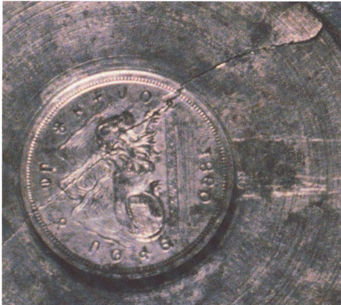
Fig. #59 Above is an enlargement of the previous picture showing the massive crack across the die. This is the original die with the three mountains.